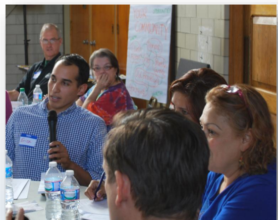
Community members discuss their vision of a stronger more vibrant neighborhood as part of a meeting hosted by MetroHealth in October.

Prior to that, MetroHealth hosted a meeting where approximately 70 community members shared their views on what the neighborhood needs to be more resident-friendly. Safer streets and parks, housing for employees, more employment opportunities and better access to public transportation were among the suggestions shared. Future community meetings are being planned to keep the conversation going.