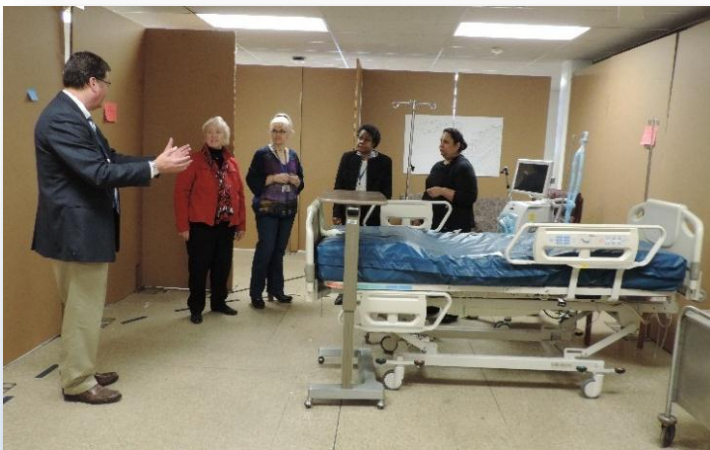
Patient and family advisers are surrounded by massive sheets of cardboard used to configure the optimal size and layout of a mock-up ICU room.

A group of employees, patients and family advisers have been playing an active role in the review of CCP expansion plans. They meet regularly to share opinions on particulars such as the layout of the ICU room, the location of family waiting rooms and interior design elements of public spaces.