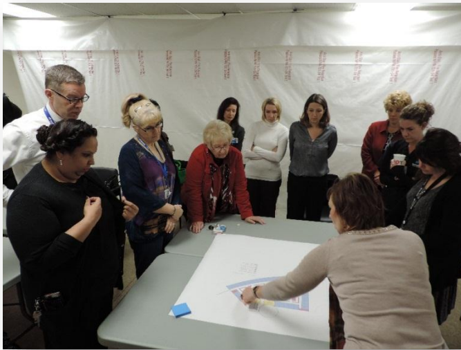
Critical Care Pavilion expansion plans are shared with employees and patient and family advisers at a meeting in December.